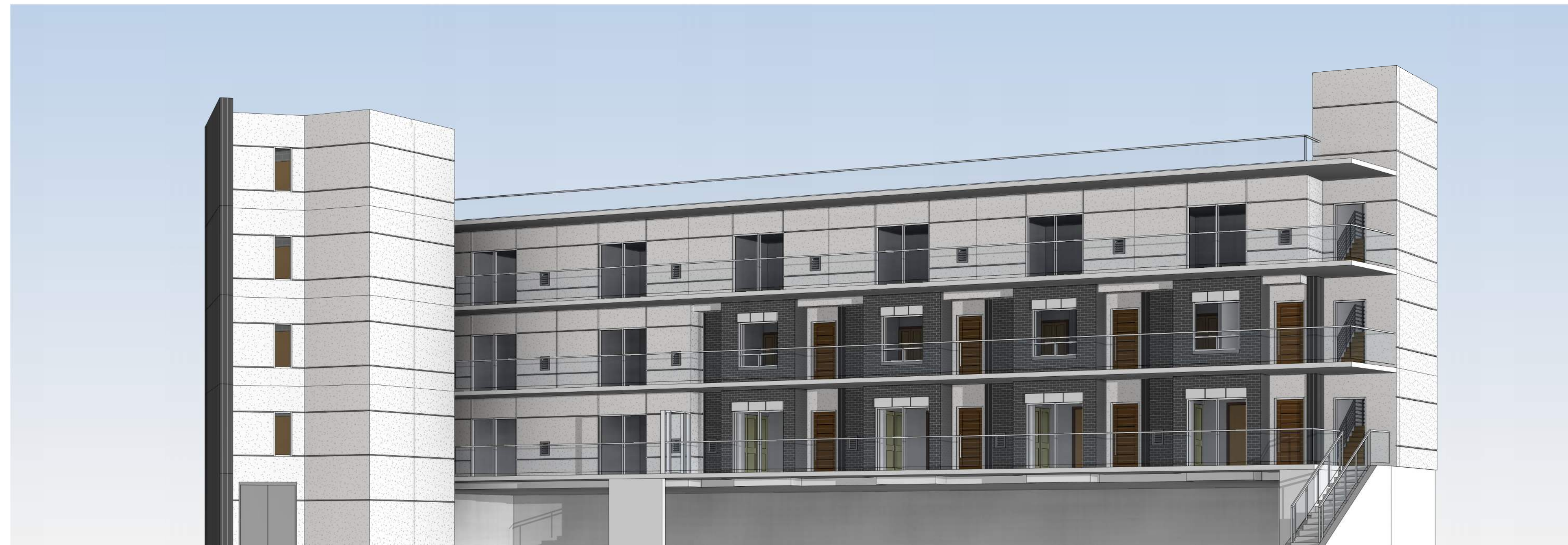
2 Proposed Building - Rear View