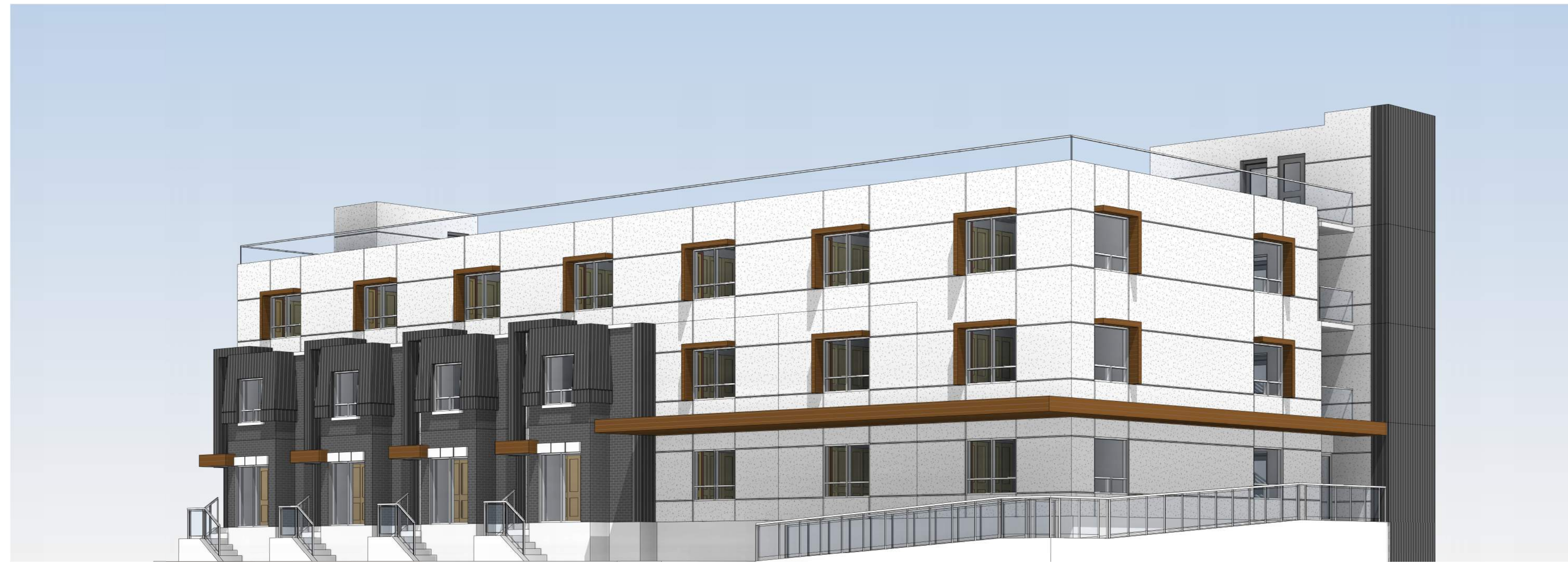
1 Proposed Building - Street View